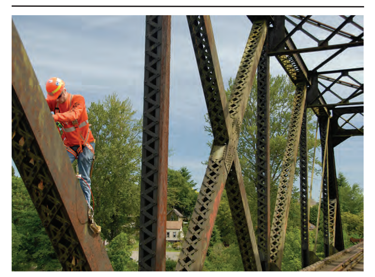
Osmose points out that the inspection of a steel thru truss is not accurate unless you actually physically climb over the upper chords and underneath the bottom chords. Corrosion, missing rivets and crack identification are key priorities during the steel inspection.

"I needed a 'one stop shop' that could provide the resources required to inspect 50foot tall timber piling along with all the details involved with the steel bridges," reports Payne. "To get off on the right foot with the communities and to reassure the shippers, I narrowed my choice down to Osmose. The combination of inspection, engineering and repair capabilities simplified the entire process. The digital reporting framework allows me to share the final reports by bridge or for the entire line with all concerned parties. With a list of priorities by bridge we had a clear path to follow."